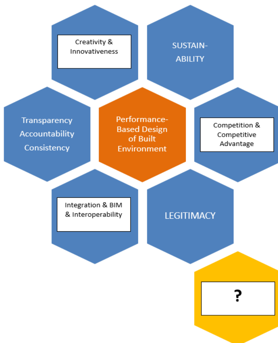
Figure 2. The keywords driving the study.